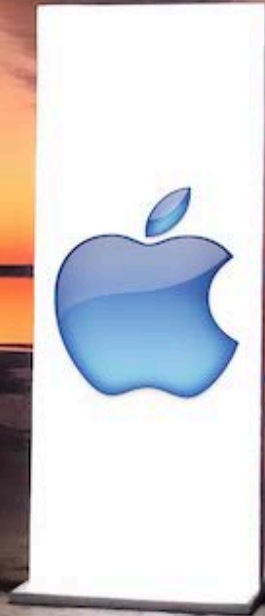
2.9m high x 1.2m wide lightbox

Our new range of illuminated display solutions are perfect for promoting and displaying your client's brands. The systems are made from an aluminium profile with powerful LED lights to illuminate the fabric graphics.